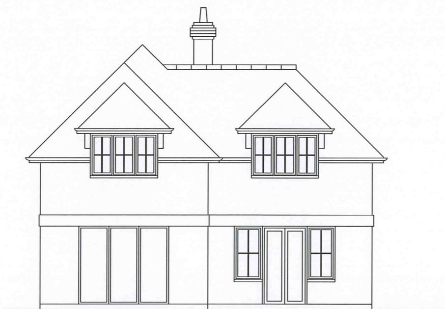
HOUSE 1 - REAR